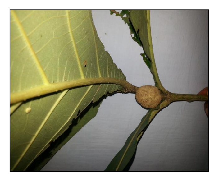
Leaf galls on Tectona grandis Linnaeus